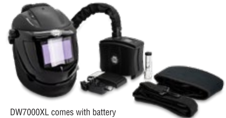
DW7000XL comes with battery powered air respirator.